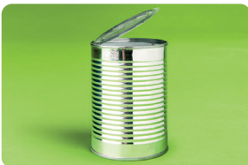
Steel & tin cans