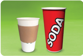
Paper beverage cups