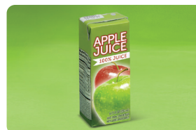
Juice boxes, milk and soup cartons