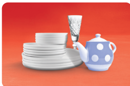
Dishes & ceramics