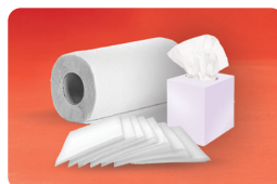
Paper towels, tissues, napkins