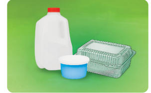
Plastic bottles, tubs, jugs & containers