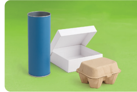
Cardboard/ boxboard tubes, boxes & egg trays