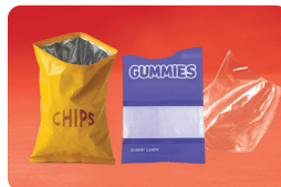
Highly-flexible plastics (bags, pouches, wrap)