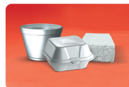
Foam packaging of any kind