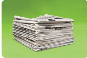
Newspaper, flyers, envelopes & office paper