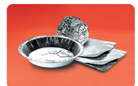
Aluminum foil, pie plates, & trays